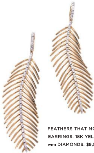
FEATHERS THAT MOVE EARRINGS. 18K YELLOW GOLD WITH DIAMONDS. $9,500

998 MADISON AVENUE, NEW YORK, NY 10075 212 274 1111